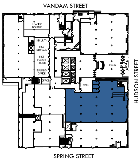
Key Plan - Not to scale